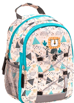
Little Lion Blue