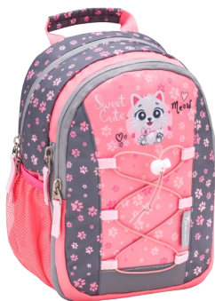
Little Sweet Caty