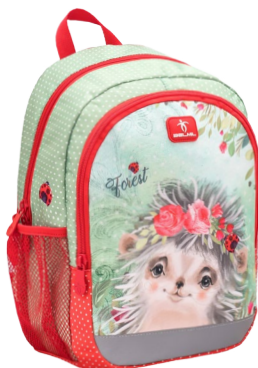
Animal Forest Hedgehog