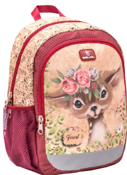
Animal Forest Bambi