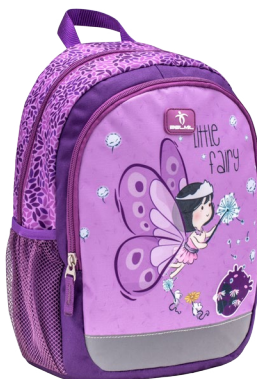
Little Fairy Purple