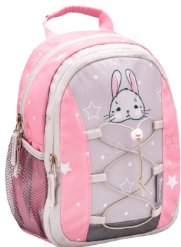
Woodland Animal Rabbit