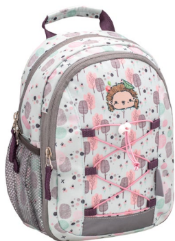
Woodland Animal Hedgehog