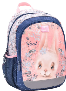
Animal Forest Bunny