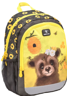
Animal Forest Bear