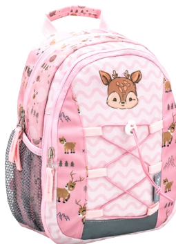
Woodland Animal Deer