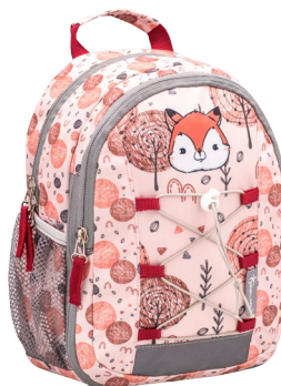
Woodland Animal Foxy